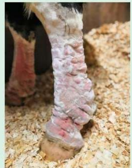
The same gelding aged 19 with advanced CPL

Feathered horses are prone to an over-production of keratin (hyperkeratosis) which makes skin crusts that feather mites love to feed on. Their bites can cause more scars and make holes that bacteria can get into.