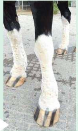
Moderate CPL in a 15 year old gelding

It is essentially a failing of the lymphatic system in the lower legs, caused partly by the fact that equines do not have muscles there to support the lymph vessels and collectors.