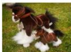
Clydesdale Soft Toy Medium $30.00 Small $15.00