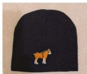
Beanies - Black or Navy $25