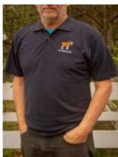
Polo Shirts $40.00