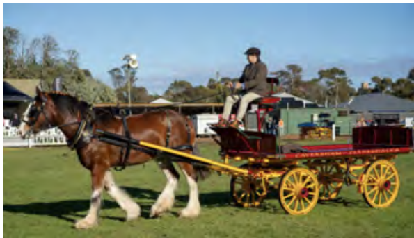
Caversham Flossie shown by Katrina Klemm

Champion Clydesdale Led Gelding Supreme Champion of Show Led Gelding